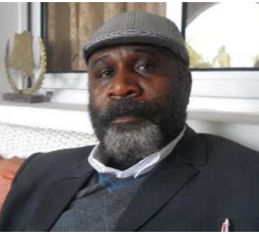
Eugène Diomi Ndongala