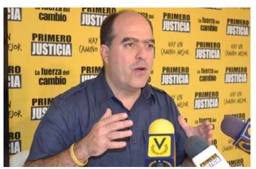
Julio Borges

I also present you for the first time the case of 14 members of the opposition in Venezuela. Two of them are suspended from parliament and had their parliamentary immunity lifted. Two others may soon follow in order to face criminal proceedings, thereby bringing the number of opposition MPs who are in the dock to five. The parliamentary authorities and the source disagree on the factual and legal basis for this action, including on the procedure to lift parliamentary immunity. That may be perfectly normal. What is worrying however is that it seems that the National Assembly, rather than the judicial authorities, is taking an active part in bringing criminal accusations against members of the opposition, thereby lending support to those who believe that the criminal cases are motivated by political rather than legal considerations. The Committee believes that a visit to Venezuela could be very helpful to promote a better understanding of the complex issues at hand. We therefore hope that the Venezuelan authorities will soon agree to the visit.