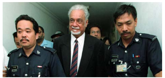
Anwar Ibrahim