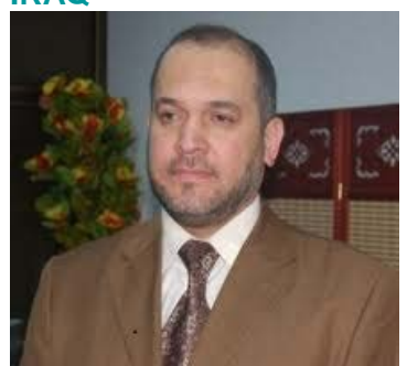
Hareth Al-Obaidi © IPU