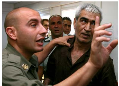
Ahmad Sa'adat