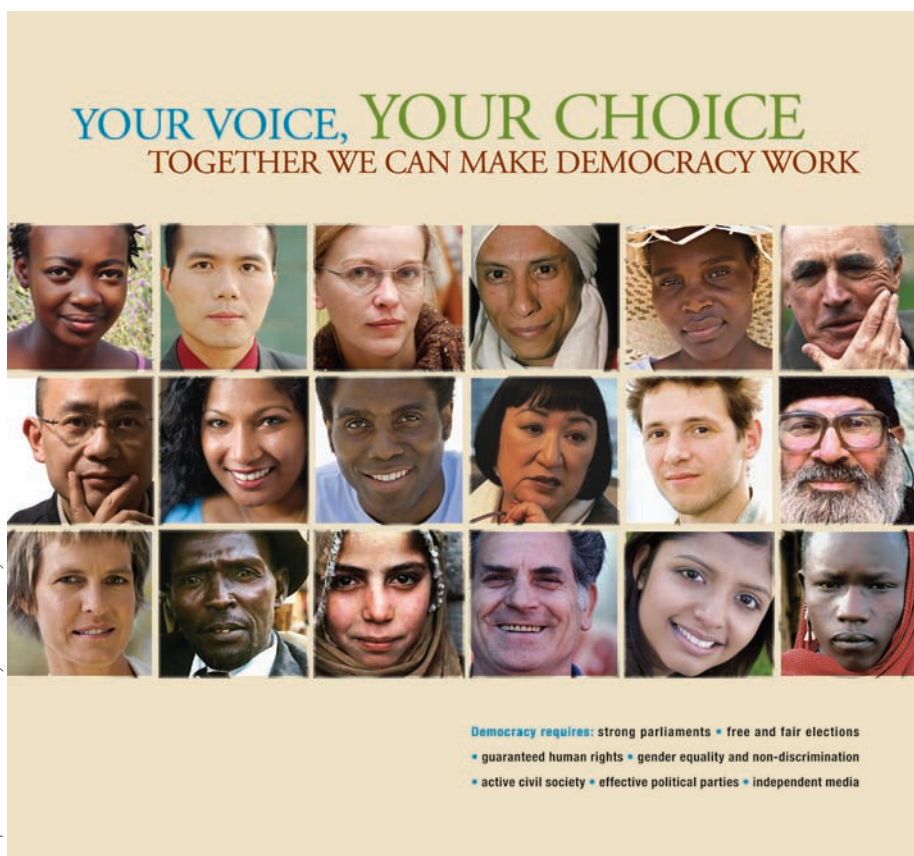
IPU poster: International Day of Democracy 2008

A parliament does not guarantee democracy, but there can be no democracy without a parliament.