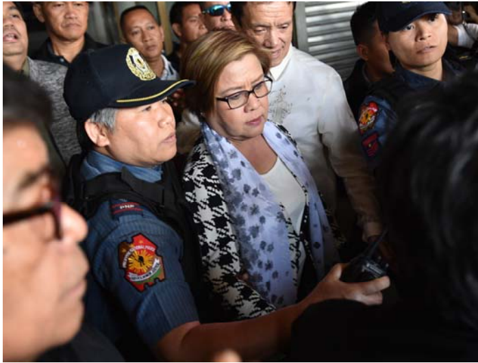
Senator Leila De Lima is escorted by police officers following her arrest at the Senate in Manila on February 24, 2017