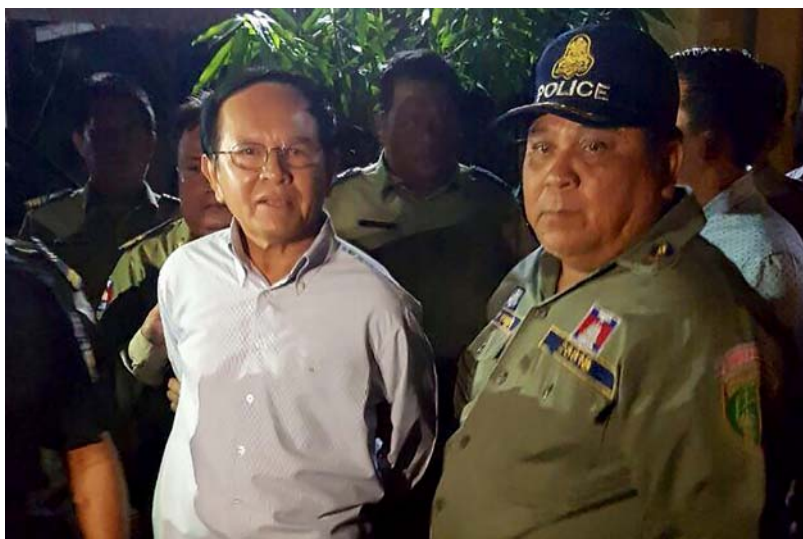
Kem Sokha is escorted by police at his home in Phnom Penh on September 3, 2017