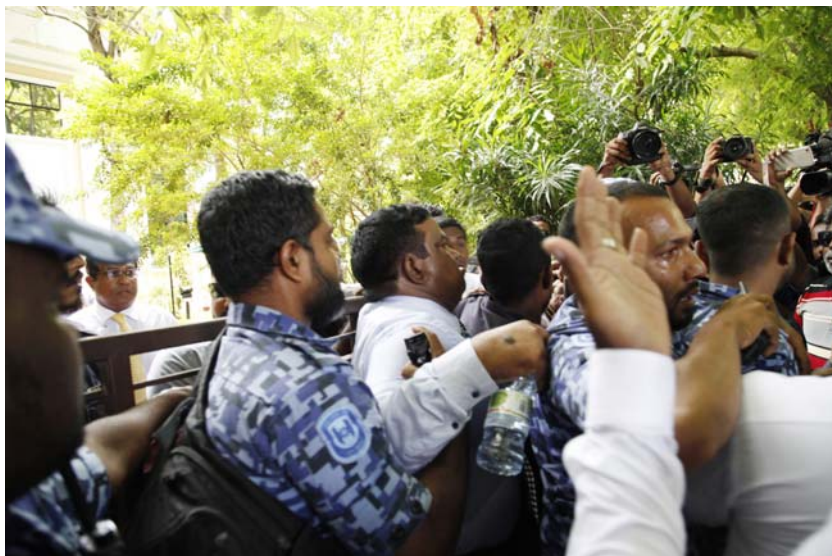
Police prevent members of parliament from entering the People's Majlis, some of who attempt to enter through the east gate, 24 July 2017