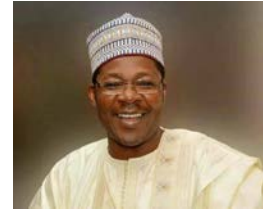
Mr. Nassirou Bako-Arifari (Benin)