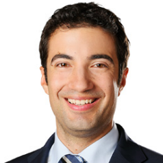
Mr. Andrea Caroni (Switzerland)