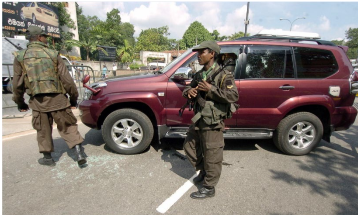
Sri Lankan army troops guard the bullet-riddled vehicle of Tamil legislator Nadarajah Raviraj, who was gunned down on 10 November 2006 in the capital, Colombo.

Decision adopted by the Committee on the Human Rights of Parliamentarians at its 163 rd session (virtual session, 1 to 13 February 2021)