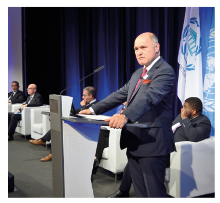
M. Wolfgang Sobotka and M. Duarte Pacheco

Mr. Duarte Pacheco, President of the IPU, evoked the IPU's long-standing commitment to counter-terrorism and emphasized the importance of addressing the root causes of the problem through education, the prevention of hate speech and the elimination of poverty. Parliamentarians needed to set an example, address the financing of terrorism and apply global treaties and conventions in national legislation.