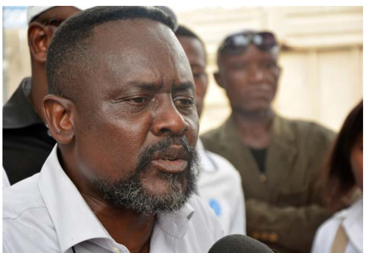
Franck Diongo, President of the MLP, Congolese opposition party

Decision adopted unanimously by the IPU Governing Council at its 204<sup>th</sup> session (Doha, 10 April 2019)