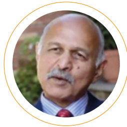
Mr. Mushahid Hussain Sayed PAKISTAN