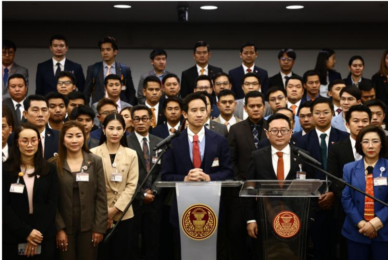
Former Move Forward Party (MFP) leader Pita Limjaroenrat (centre) and fellow MFP members of parliament attend a press conference at the Thai parliament in Bangkok.

Decision adopted by the Committee on the Human Rights of Parliamentarians at its 176th session (Geneva, 3 to 19 February 2025)