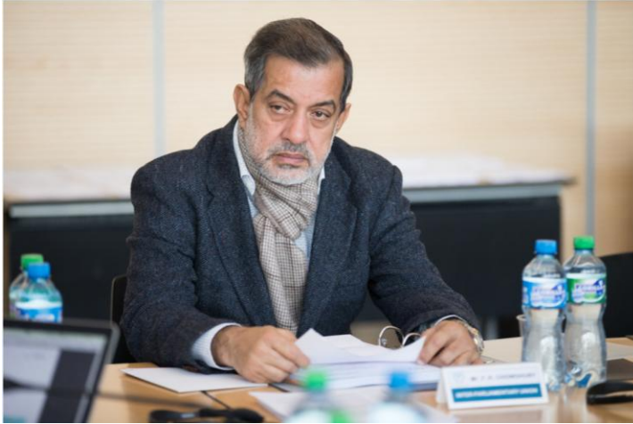
© IPU 138 – Committee on the Human Rights of Parliamentarians (23 March 2018)