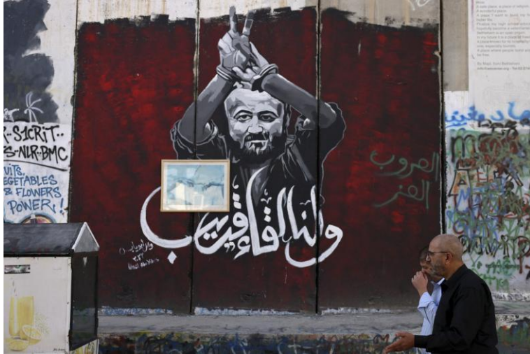
Men walk past a section of Israel's separation barrier painted with a portrait of Palestinian Marwan Barghouti held in an Israeli jail

Decision adopted by the Committee on the Human Rights of Parliamentarians at its 176th session (Geneva, 3 to 19 February 2025)