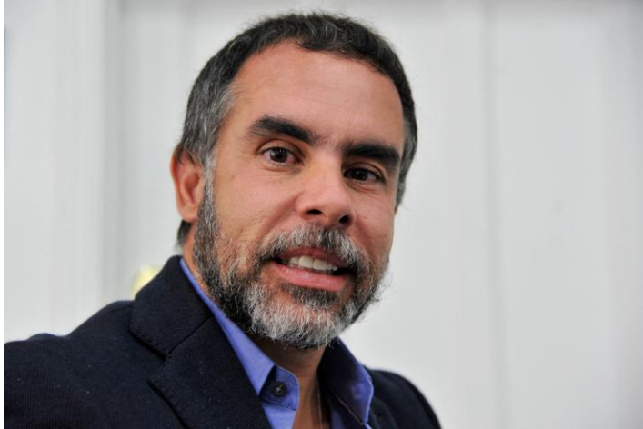
Colombian senator Armando Benedetti.

Decision adopted by the Committee on the Human Rights of Parliamentarians at its 176th session (Geneva, 3 to 19 February 2025)