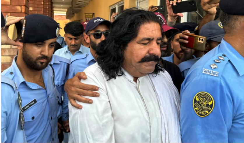
Police officials arrested Pashtun human rights activist and former National Assembly Member Ali Wazir (centre) after a rally against enforced disappearances in Pakistan in Islamabad on 20 August 2023.

Decision adopted by the Committee on the Human Rights of Parliamentarians at its 176th session (Geneva, 3 to 19 February 2025)