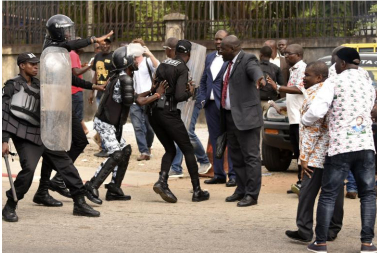
Riot police (left) face members of the political party Generations and Peoples Solidarity (GPS) in front of the party's headquarters in Abidjan on 23 December 2019, after police intervened to evacuate party members.