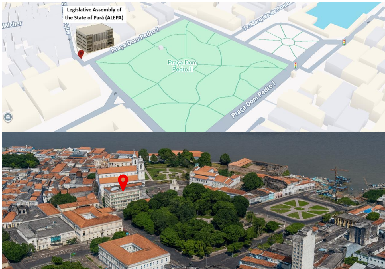
Figure A | Legislative Assembly of the State of Pará (ALEPA) and its surroundings at Dom Pedro II Square, in Belém's historic centre.