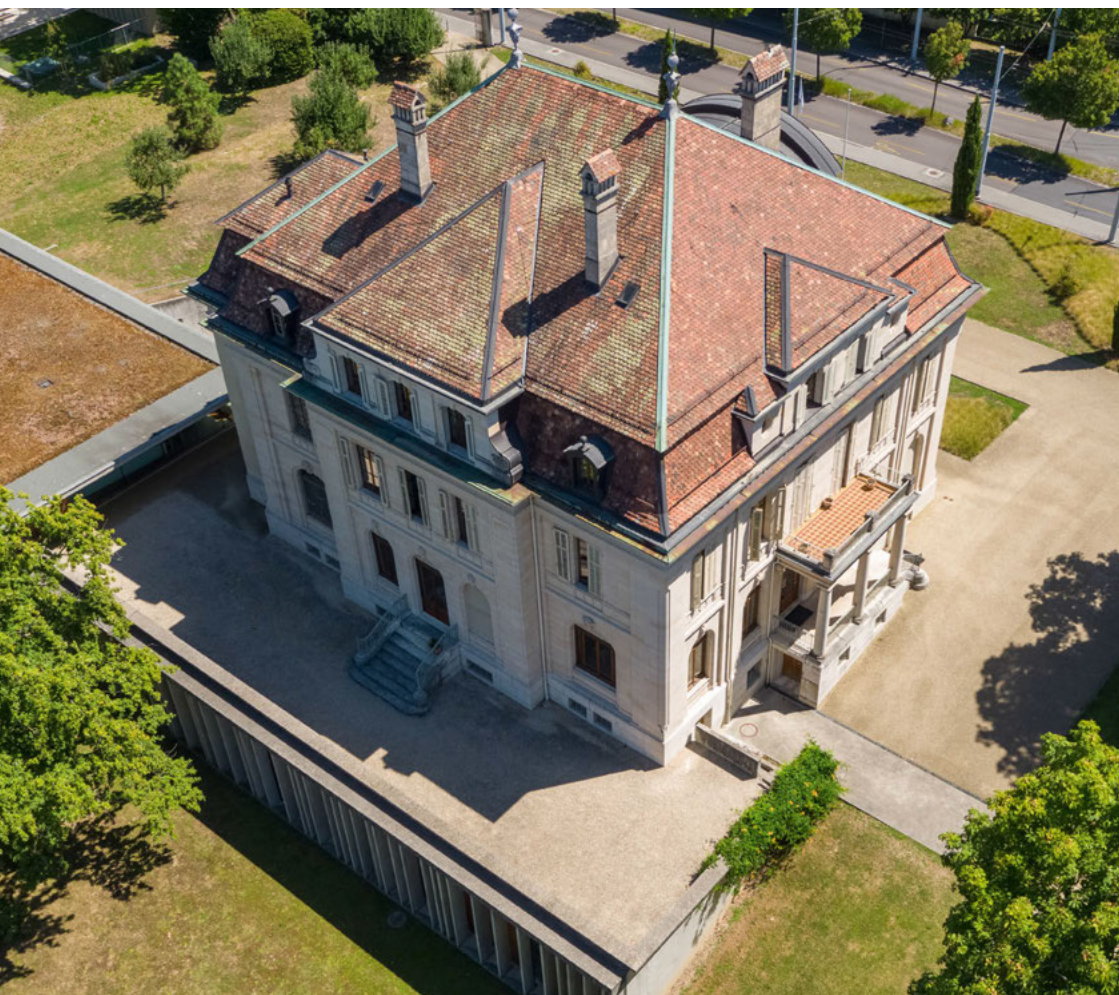
The IPU headquarters in Geneva, Switzerland.