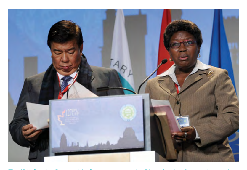
The IPU Gender Partnership Group presents the Plan of action for gender-sensitive parliaments for adoption by the 127<sup>th</sup> Assembly (Quebec City, 26 October 2012).