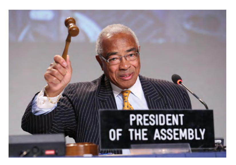
The Plan of action is adopted by the 127th IPU Assembly.