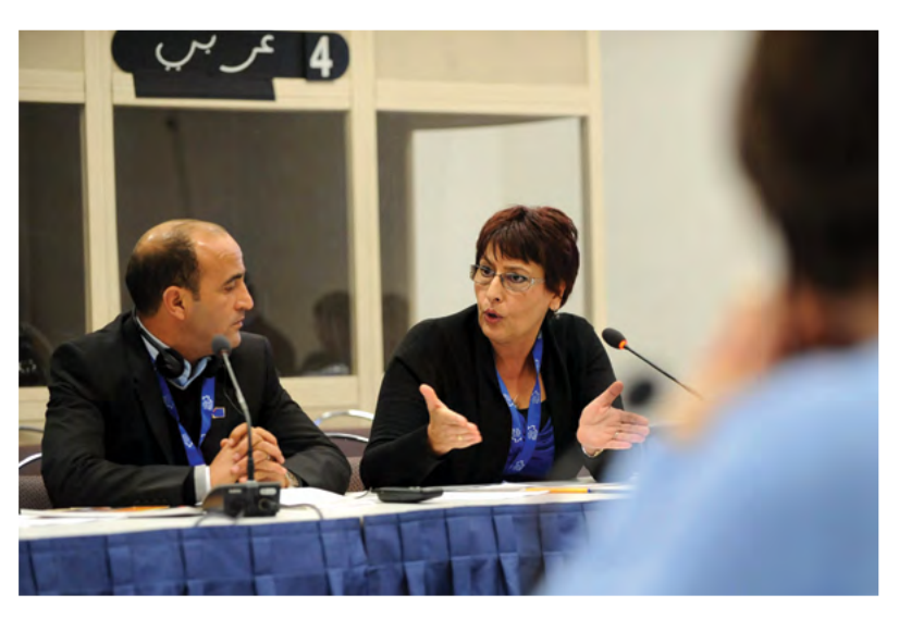
Working Group on "Mainstreaming gender in all of parliament's work", Special session on gender-sensitive parliaments (Quebec City, 25 October 2012).