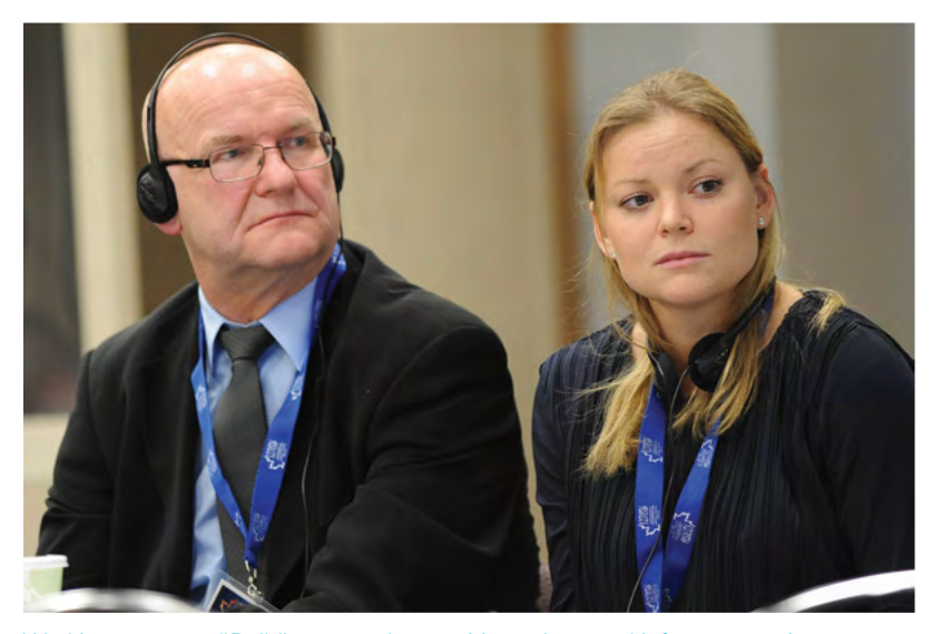
Working group on "Building a gender-sensitive culture and infrastructure in parliament," Special session on gender-sensitive parliaments (Quebec City, 25 October 2012).