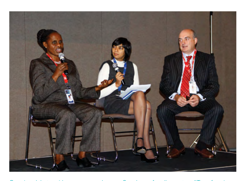
Opening debate with a woman and a man Speakers of parliament on "Transforming parliaments for gender equality," Special session on gender-sensitive parliaments (Quebec City, 23 October 2012).