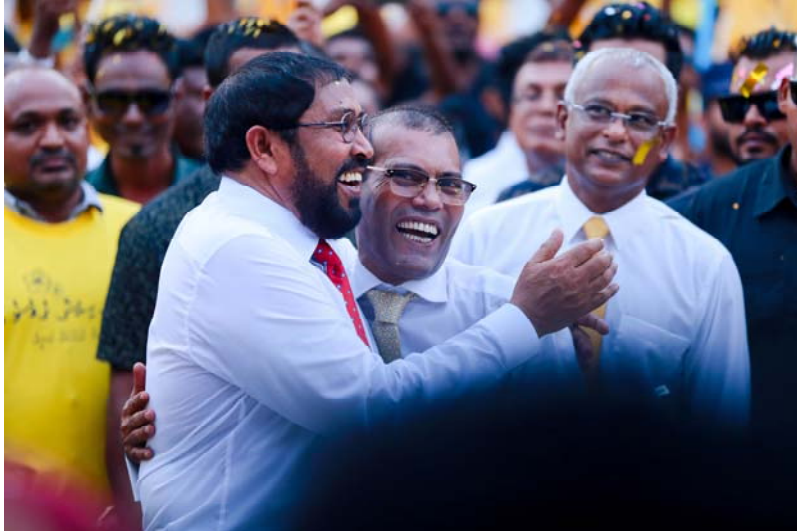
Former president of the Maldives Mohamed Nasheed (C) is embraced by Jumhoory Party leader Qasim Ibrahim (L) as president-elect Ibrahim Mohamed Solih (R) looks on after Nasheed returned from exile to the Maldives, in Male on November 1, 2018

Decision adopted by the Committee on the Human Rights of Parliamentarians at its 158 th session (Geneva, 8 February 2019)