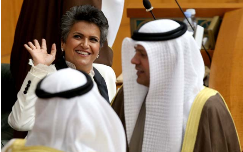
Kuwaiti MP Safaa Al-Hashem waves as she attends the opening session of the new parliament in Kuwait City, on December 11, 2016

Decision adopted by the Committee on the Human Rights of Parliamentarians at its 158 th session (Geneva, 8 February 2019)