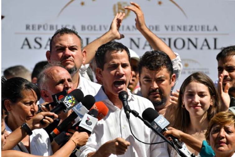
Venezuela's National Assembly President Juan Guaidó speaks before a crowd of opposition supporters during an open meeting in Caraballeda, Venezuela, on 13 January 2019

Decision adopted by the Committee on the Human Rights of Parliamentarians at its 158 th session (Geneva, 8 February 2019)