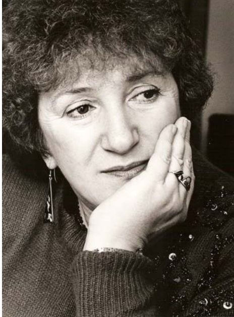
Galina Starovoitova

Decision adopted by the Committee on the Human Rights of Parliamentarians at its 158 th session (Geneva, 8 February 2019)