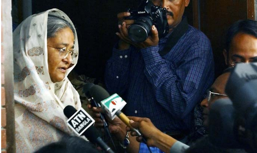
Leader of the Awami League, Sheikh Hasina Wajed (L) talks with reporters standing at the door of her house in Dhaka, 23 August 2004.

Decision adopted by the Committee on the Human Rights of Parliamentarians at its 158 th session (Geneva, 8 February 2019)