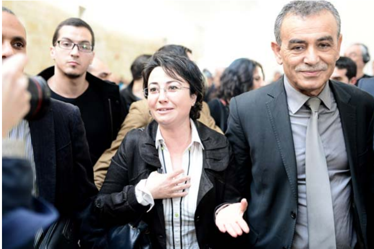
Arab member of Israel's Knesset Haneen Zoabi (C) and Jamal Zahalka (R) speaking to the press on February 14, 2015

Decision adopted by the Committee on the Human Rights of Parliamentarians at its 158 th session (Geneva, 8 February 2019)