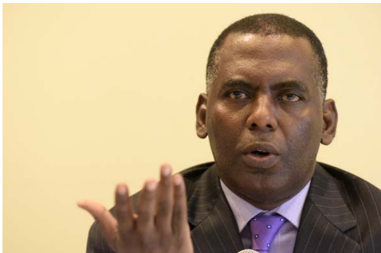
Mauritanian politician and advocate for the abolition of slavery Biram Dah Abeid gestures during a press conference in Dakar on September 29, 2016

Decision adopted by the Committee on the Human Rights of Parliamentarians at its 158 th session (Geneva, 8 February 2019)