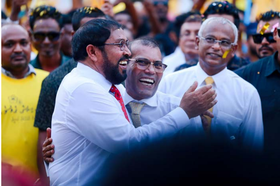
Former president of the Maldives, Mohamed Nasheed (centre), is embraced by Jumhoory Party leader, Qasim Ibrahim (left), as President-elect, Ibrahim Mohamed Solih (right), looks on after Nasheed returned from exile to the Maldives, in Male on 1 November 2018

Decision adopted unanimously by the IPU Governing Council at its 204 th session (Doha, 10 April 2019)