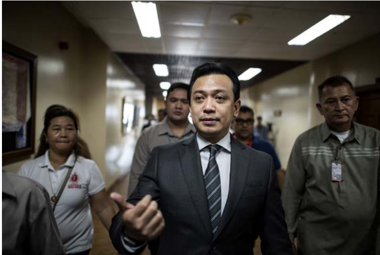
Senator Trillanes arrives at the Senate building in Manila on 25 September 2018. Senator Trillanes, a vocal critic of President Duterte, was arrested but posted bail in proceedings that the lawmaker decried as a "failure of democracy"

Decision adopted unanimously by the IPU Governing Council at its 204 th session (Doha, 10 April 2019)