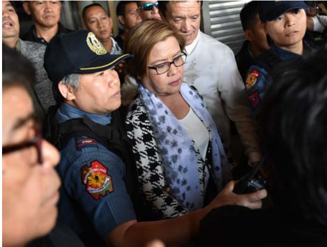
Philippine Senator Leila de Lima is escorted by police after her arrest at the Senate in Manila on 24 February 2017

Decision adopted unanimously by the IPU Governing Council at its 204 th session (Doha, 10 April 2019)