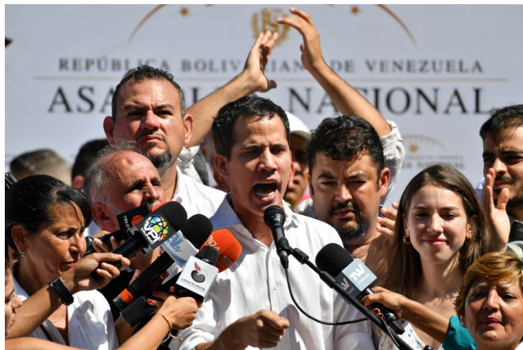
Venezuela's Speaker of the National Assembly Juan Guaidó speaks before a crowd of opposition supporters during an open meeting in Caraballeda, Venezuela, on 13 January 2019

Decision adopted unanimously by the IPU Governing Council at its 204 th session (Doha, 10 April 2019)