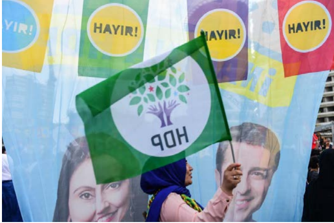
Pictures of Selahattin Demirtas and Figen Yüksekdağ, jailed leaders of the Pro-Kurdish opposition Peoples' Democratic Party, are seen on a flag as supporters of the pro-Kurdish opposition Peoples' Democratic Party (HDP) and of the 'Hayir' ('No') campaign attend a rally for the upcoming referendum in Istanbul, on 8 April 2017. On 16 April 2017, Turkey voted on whether to change the current parliamentary system into an executive presidency.

Decision adopted by consensus by the IPU Governing Council at its 204 th session (Doha, 10 April 2019) 2