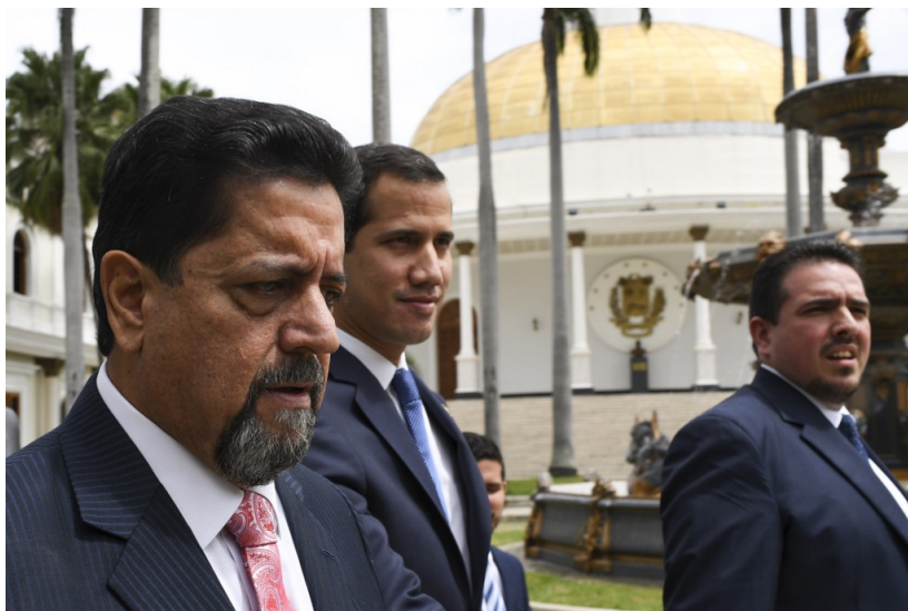
(L to R) Mr. Edgar Zambrano, First Deputy Speaker of the National Assembly, Mr. Juan Guadó, Speaker of the National Assembly, and Mr. Stalin González, Second Deputy Speaker of the National Assembly, arrive for a session of the National Assembly in Caracas on 24 September 2019