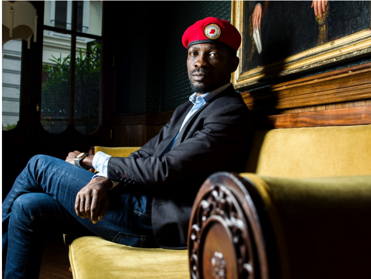
Bobi Wine, June 2019

UGA19 - Robert Kyagulanyi Ssentamu (aka Bobi Wine)