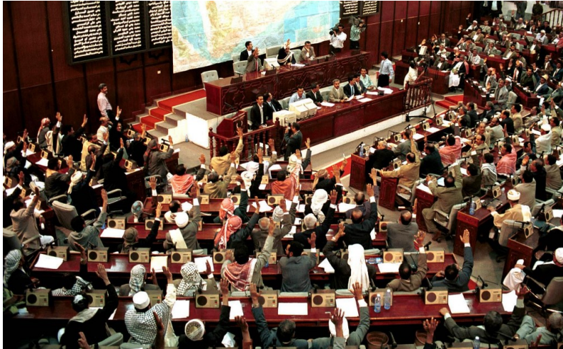
Yemeni members of parliament vote in Sana'a on 24 June 2000 to approve the 12 June border accord signed with Saudi Arabia.