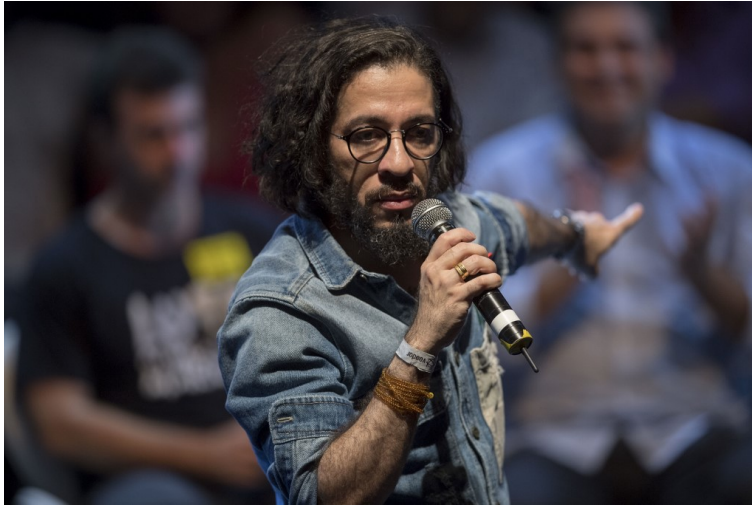
Jean Wyllys, Rio de Janeiro federal deputy for the Socialism and Liberty Party (PSOL), speaks during a rally of Brazilian leftist parties at Circo Voador in Rio de Janeiro, Brazil, on 2 April 2018.