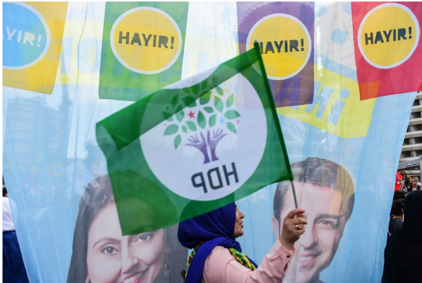
Pictures of Selahattin Demirtaş and Figen Yüksekdağ, jailed leaders of the pro-Kurdish opposition People's Democratic Party (HDP), are seen on a flag as supporters of the HDP and the 'Hayir' ('No') campaign attend a rally on 8 April 2017 in Istanbul about the referendum held on 16 April 2017, in which Turkey voted on whether to change the current parliamentary system into an executive presidency.