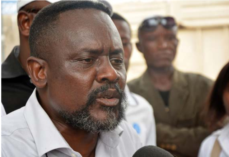
Franck Diongo, President of the MLP, Congolesse opposition party

Decision adopted unanimously by the IPU Governing Council at its 204 th session (Doha, 10 April 2019)