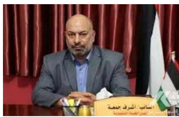
Ashraf Jumaa