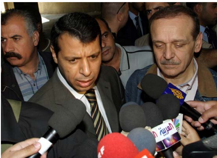
Former Palestinian Security Minister Mr. Mohamed Dahlan (L) speaks to reporters outside the offices of the Palestine Liberation Organization, 8 November 2004.

Decision adopted unanimously by the IPU Governing Council at its 203<sup>rd</sup> session (Geneva, 18 October 2018)