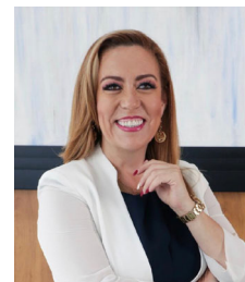
Ms. Alejandra Reynoso (Mexico)

The Inter-Parliamentary Union, the world organization of national parliaments, set up a procedure in 1976 for the treatment of complaints regarding human rights violations of parliamentarians. It entrusted the Committee on the Human Rights of Parliamentarians with implementing that procedure.