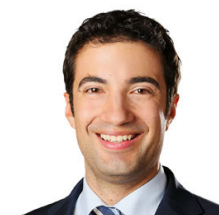
Mr. Andrea Caroni (Switzerland)