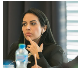
Ms. Delsa Solórzano, Vice-President (Venezuela)