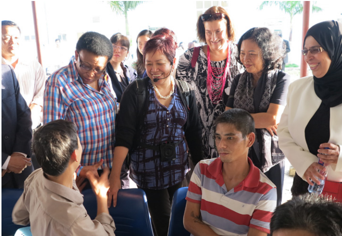
IPU Advisory Group on Health mission in Viet Nam