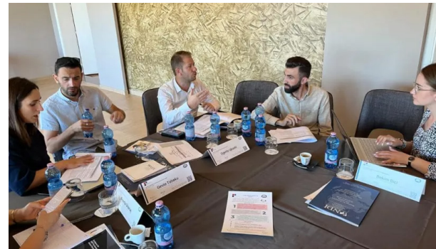
Activity using the Indicators for Democratic Parliaments in Albania

In Albania, a 2020 survey revealed differing perceptions of parliament among MPs, parliamentary staff, journalists and civil society leaders. This produced an initiative to establish standards on transparency and citizen engagement. Together with the National Democratic Institute and using the Indicators for Democratic Parliaments, the Parliament set up a joint working group to develop a framework of standards and indicators. The group included representatives from civil society and 14 from the media. Albania's Parliament endorsed the new standards in March 2024. An independent assessment is scheduled soon, and will be a crucial step in drafting an Open Parliament Action Plan.