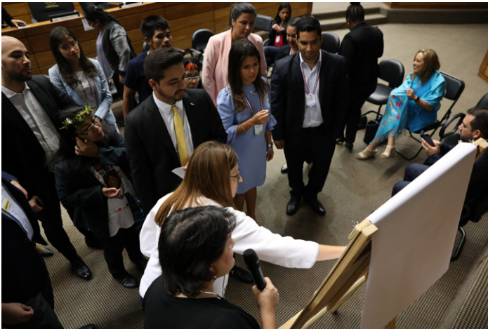
Global Conference of Young Parliamentarians in Paraguay

Ultimately, parliaments exist to serve the people, who aspire to live in peace and prosperity, coexist harmoniously with their neighbours, and enjoy basic freedoms. Parliaments that effectively meet these needs offer a powerful counternarrative to those who question the value of democracy and its capacity to address future challenges. The next decade will be critical for the future of democracy. The Common Principles will continue to unite parliaments and partners by providing a framework that empowers them to meet the needs and aspirations of the people, and to slow, or even reverse, democratic backsliding.