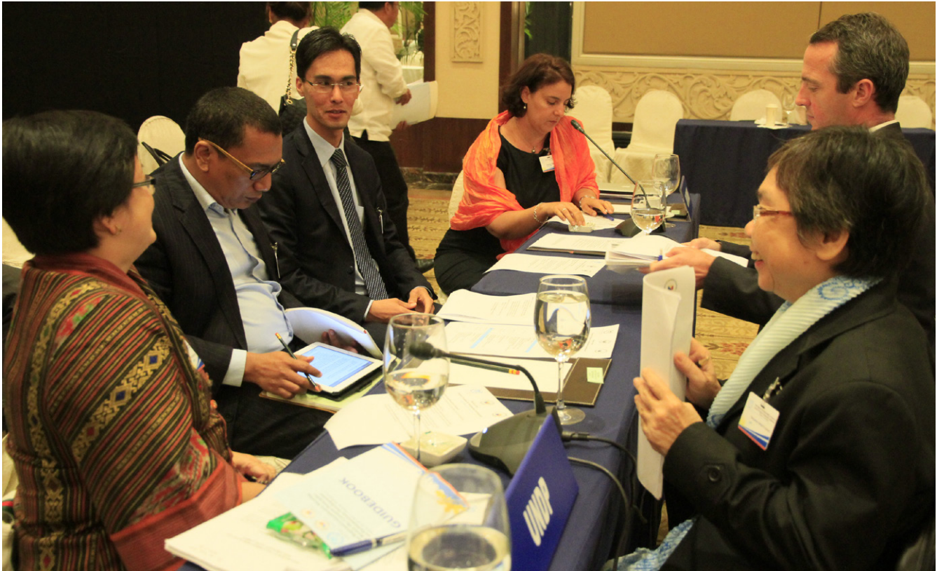
Consultation for the Common Principles in the Philippines