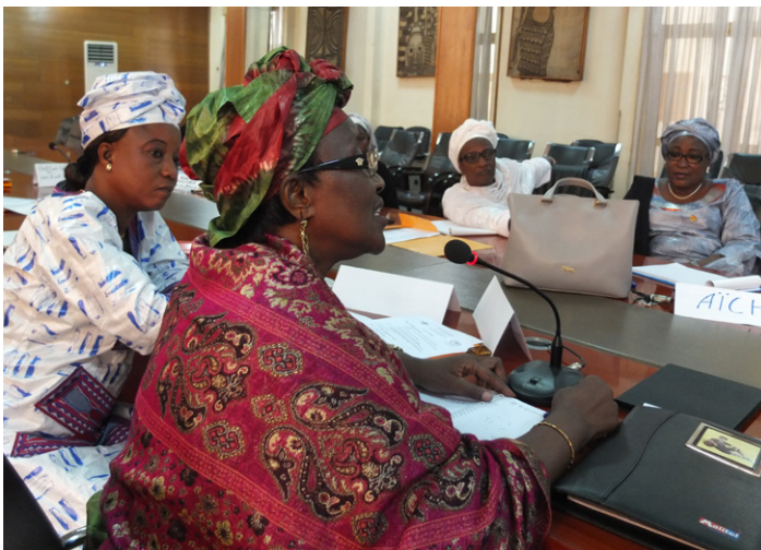
Activity with parliamentarians on gender equality in Mali

Costa Rica has created an Open Parliament Commission, which aims to increase citizen participation in parliamentary business. The Commission includes deputies, officials and civil society organizations.