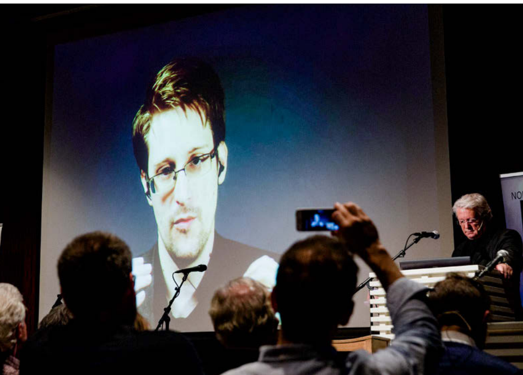
US whistleblower Edward Snowden is seen live from Moscow at a Norwegian PEN event in Oslo in November 2016.

There are three functions common to parliaments in democracies: representation, law-making, and oversight. The first refers to the idea of representing the interests of citizens or constituents, the second to parliament's role in adopting legislation and the third, while broad in scope, focuses particularly on oversight of the executive and, in particular, oversight of the proper implementation of laws.