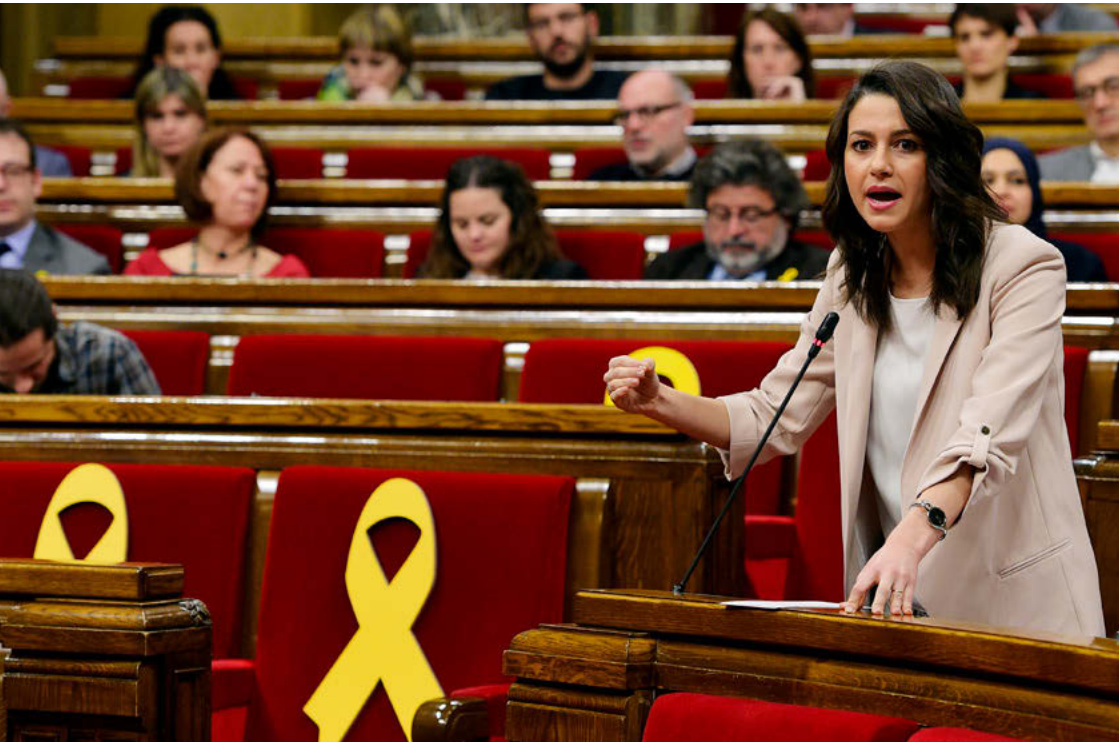
Ciudadanos (Citizens) member of the Catalan Parliament Inés Arrimadas speaks in Parliament to debate on the jailed separatist leaders' right to be inaugurated in March 2018.

The core idea behind the doctrine of parliamentary immunity is that, to be able to function successfully as an institution, including to be able to represent the electorate, parliament needs to be independent from the executive and judicial branches of government. This usually takes the form of immunizing parliament and its members from legal suit and recognizing the power of parliament to run its own affair. Although this doctrine is often cast as a “privilege” of parliament, in fact the goal is to protect the rights of the public as a whole, rather than the immediate beneficiaries of the doctrine, through the effective functioning of their parliament and their representatives in it. Special protection for the free speech rights of parliamentarians, at least in parliament, is a central element of the doctrine of immunity but it goes well beyond this.