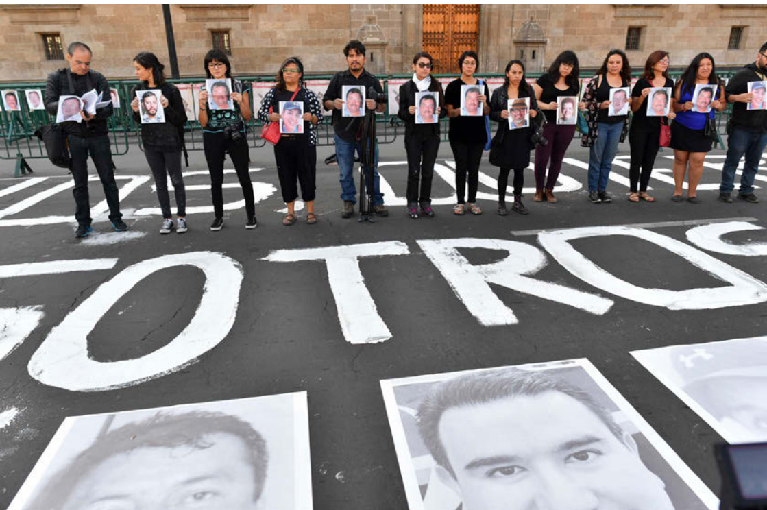
Members of the press hold images of colleagues during a protest in Mexico City in June 2018 against the murder or disappearance of journalists in Mexico.

This chapter looks at some of the specific aspects of relationships between parliaments and their members and three other sets of social actors: the media, officials and political parties. In each case, there are certain expectations on both sides, and some established better practice as well as, in some cases, legal requirements flowing from the guarantee of freedom of expression under international law.