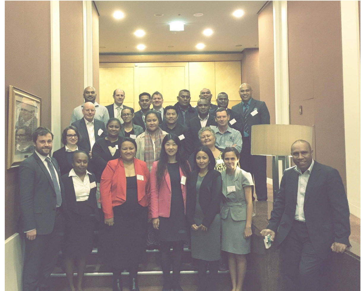
Pacific regional workshop on the Model Provisions on Counter Terrorism and Transnational Organised Crime, 18 – 19 May 2016, Auckland, New Zealand