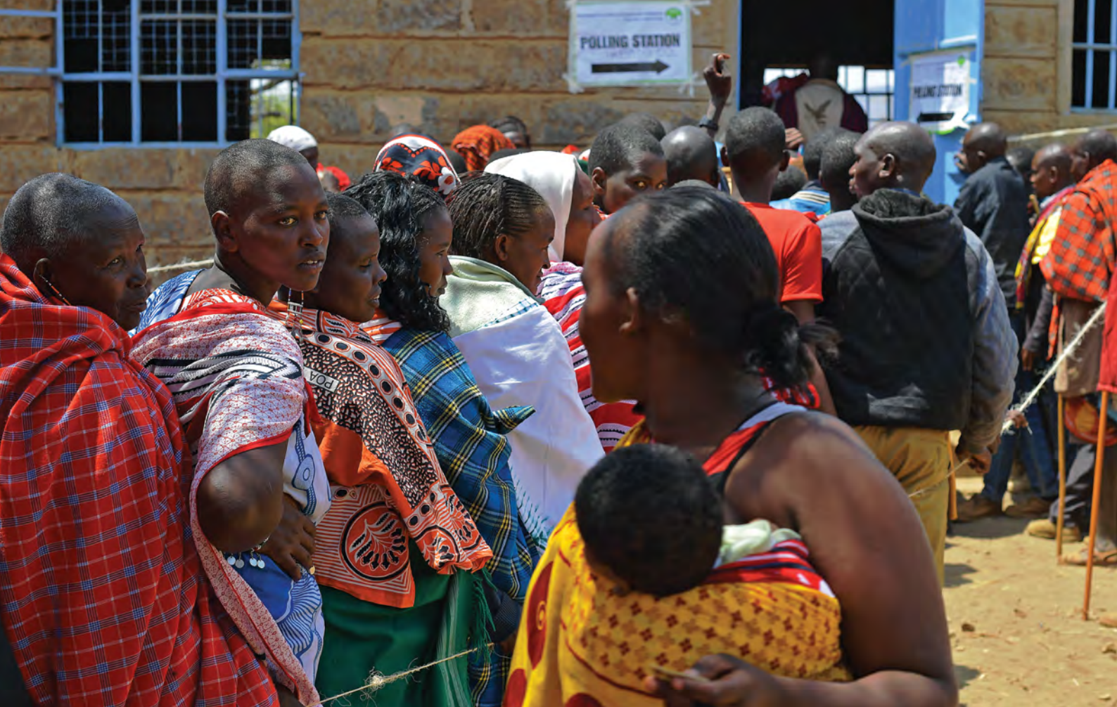
Kenya, 2017

demonstrated their electoral popularity with considerable vote gains over their rivals. Among them, young women also made their mark, with two women under the age of 27 elected for the first time. These achievements came in spite of the parliament's successive failure to ratify the 2010 constitutional provision for a 33 per cent gender quota, and in the face of what has been called "pervasive" violence against women in elections. A clear sign that women's increased political and electoral participation still lacks a level of legitimacy among certain groups in society, Kenyan women candidates reported numerous incidences and threats of violence, both against them personally and against family members and supporters.