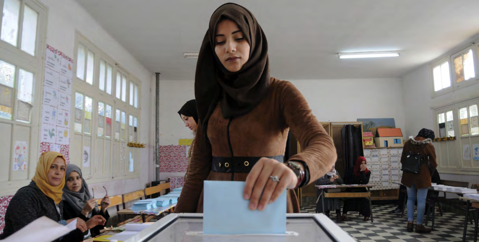
Algeria, 2017

In Qatar, in 2017 the Emir partially renewed the Advisory Council. Among the new members, four women were appointed for the first time in the country's history. Two Qatari women had been previously elected at the municipal council level.