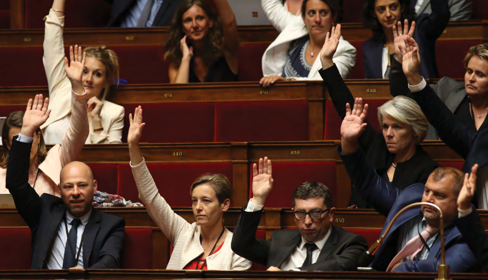
France, 2017