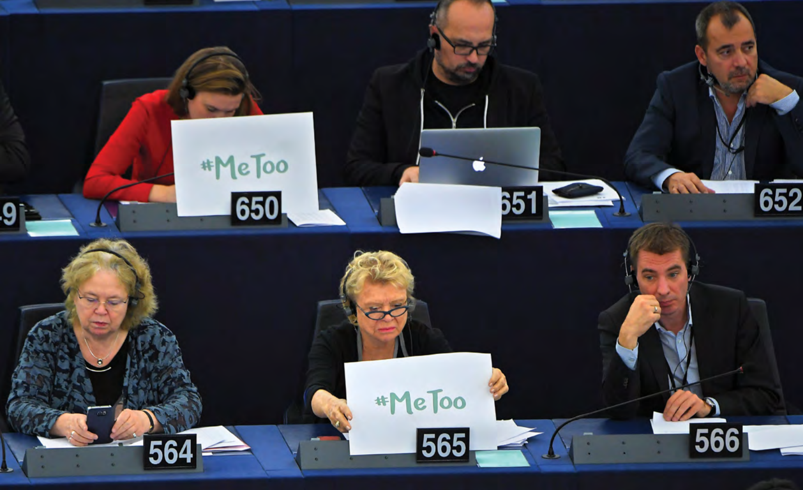
European Parliament, 2017

While Angela Merkel retained her position as Chancellor of the Federal Republic of Germany for a fourth term, she now works with a Bundestag (lower house) with noticeably fewer women. Overall, the proportion of women elected to the legislature in 2017 fell by 5.7 percentage points to 30.7 per cent, the lowest level in almost 20 years. Those parties that returned the highest number of women were those that have adopted voluntary gender quotas: the Social Democratic Party, the Left, and the Greens (41.8%, 53.6%, and 60.9% of successful women candidates, respectively). Fewer than 20 per cent of the seats occupied by Merkel's Christian Democratic Union/Christian Socialist Union party, which has no gender quota, are held by women, the second lowest of the six parties now represented in the Bundestag. Likewise, the newest arrival on the parliamentary scene – the Alternative for Germany (AfD) party – and the Free Democrats (FDP) – have no gender quotas; women make up only 10.9 per cent and 23.8 per cent of their MPs, respectively.