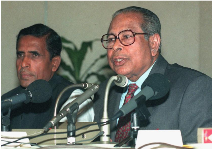
Shah Ams Kibria (right) presents the national budget in parliament on 13 June 1997

Decision adopted unanimously by the IPU Governing Council at its 213th session (Geneva, 27 March 2024)