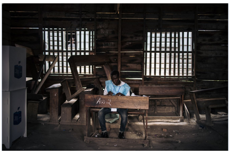
An official from the Independent National Electoral Commission (CENI) registers voters at a polling station at the Institut Ndahura in Goma on 21 December 2023.

Decision adopted unanimously by the IPU Governing Council at its 214th session (Geneva, 17 October 2024)