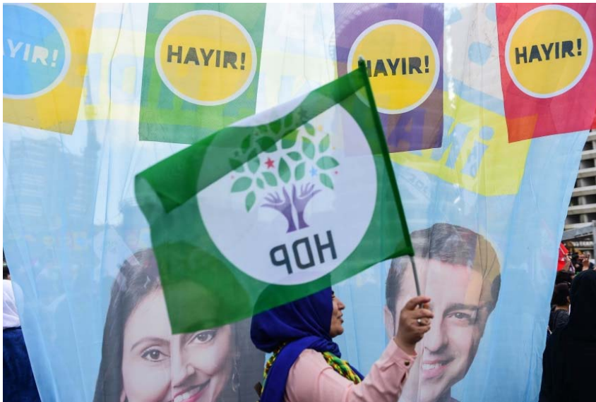
Pictures of Selahattin Demirtaş and Figen Yüksekdağ, jailed leaders of the pro-Kurdish opposition People's Democratic Party (HDP), are seen on a flag as supporters of the HDP and the 'Hayir' ('No') campaign attend a rally on 8 April 2017 in Istanbul about the referendum held on 16 April 2017, in which Turkey voted on whether to change the current parliamentary system into an executive presidency.

Decision adopted by consensus by the IPU Governing Council at its 205 th session (Belgrade, 17 October 2019) 1