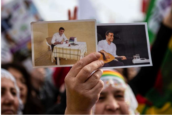
A supporter of the pro-Kurdish Peoples' Democratic Party (HDP) holds pictures of jailed former party leader Selahattin Demirtaş during a 'Peace and Justice' rally in Istanbul on February 3, 2019.

Decision adopted by the Committee on the Human Rights of Parliamentarians under Rule 12(4) of its Rules and Practices (29 May 2020)