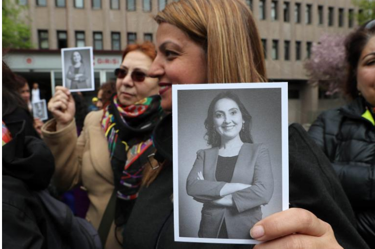
A demonstrator holds up a picture of Figen Yüksekdağ during the trial of the co-leader of the pro-Kurdish party People's Democratic Party (HDP) in front of the court in Ankara on 13 April 2017.

Decision adopted by consensus by the IPU Governing Council at its 216th session (Geneva, 23 October 2025) 1