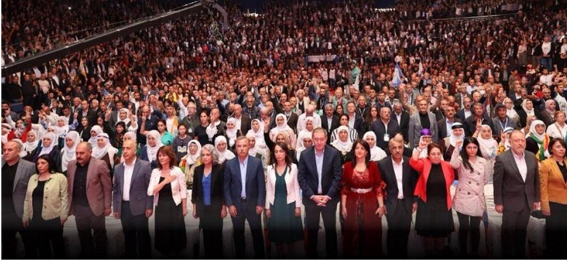
Peoples' Equality and Democracy Party (DEM) on 15 October in Ankara.

Decision adopted by consensus by the IPU Governing Council at its 216th session (Geneva, 23 October 2025) 1