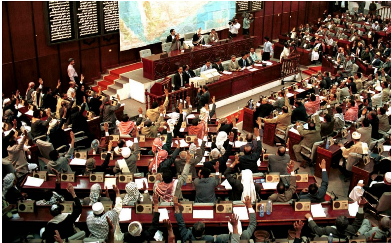
Yemeni members of parliament vote in Sana'a on 24 June 2000 to approve the 12 June border accord signed with Saudi Arabia.

Decision adopted by the Committee on the Human Rights of Parliamentarians at its 162 nd session (virtual session, 31 October 2020)