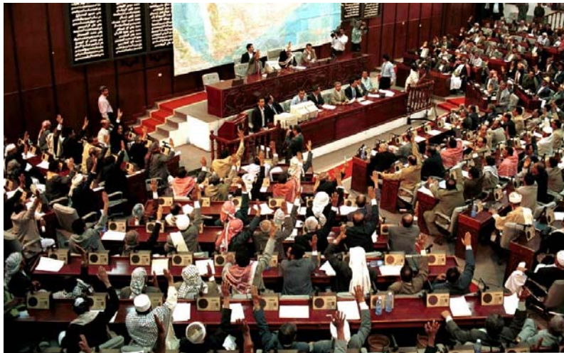
Yemeni members of parliament vote in Sana'a on 24 June 2000 to approve the 12 June border accord signed with Saudi Arabia.

Decision adopted by consensus by the IPU Governing Council at its 205 th session (Belgrade, 17 October 2019) 1