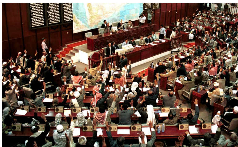
Yemeni members of parliament vote in Sana'a on 24 June 2000 to approve the 12 June border agreement signed with Saudi Arabia

Decision adopted unanimously by the IPU Governing Council at its 207 th session (Virtual session, 25 May 2021)